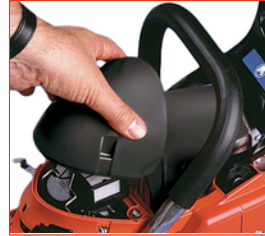
Easy filter maintenance