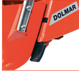
Optimum chip exhaust for avoiding jams