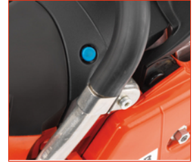
Low starting effort with decompression valve